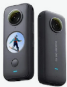
360 CAMERA Quick, Immersive Mapping