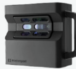
MATTERPORT Photorealistic Walk-Throughs